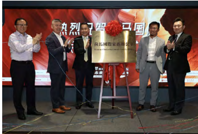
Mainland wealth management company Homaer International sets up multi-family office in Hong Kong 內地財富管理公司荷馬國際在香港開設家族辦公室業務