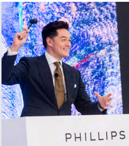
Phillips Auctioneers moves its Asia headquarters to the West Kowloon Cultural District