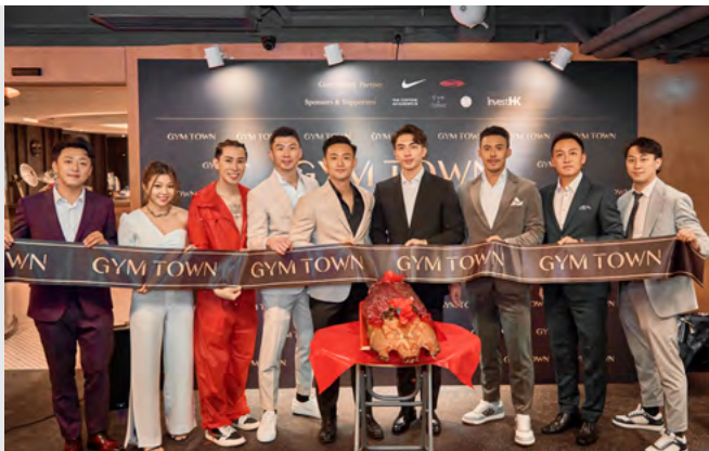
Gym Town Fitness upgrades with big space and a gym club concept Gym Town Fitness擴充空間 銳意打造健身會所概念