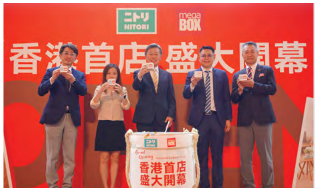
Japanese furniture and home-furnishing retail company Nitori opens first flagship store in Hong Kong 日本傢俬和家品零售店Nitori首間香港旗艦店開幕