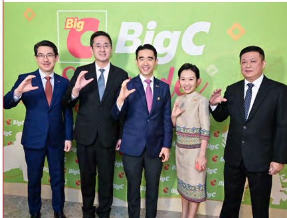
Big C Supercenter unveils first series of stores kickstarting massive foothold in city

投資推廣署隨時歡迎內地及海外投資者在香港建立業務，協助他們在全球最適合營商的城市之一取得成功。我們的團隊是對各行業有深厚認識的市務人員和專家，他們為客戶在各個業務發展階段提供支援，包括初步規劃、業務開展以至進一步擴張。我們為客戶提供有關法律與規管條例的資訊、相關政府部門及專業服務轉介、宣傳工作以及商務聯宜活動。所有服務都是量身訂造，保密和免費。在2023年我們協助過的客戶包括：