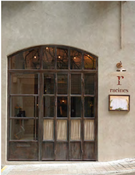
French fine dining restaurant Racines brings authentic French taste to Hong Kong 法國高級餐廳Racines為香港帶來地道法式菜餚