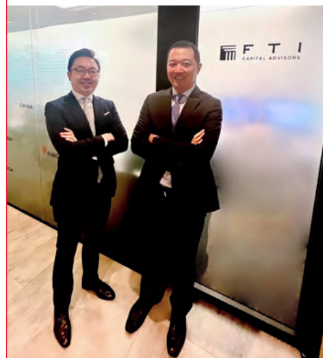
FTI Capital Advisors strengthens positioning in Asia with Hong Kong expansion 富事高資本擴展香港業務鞏固亞洲地位