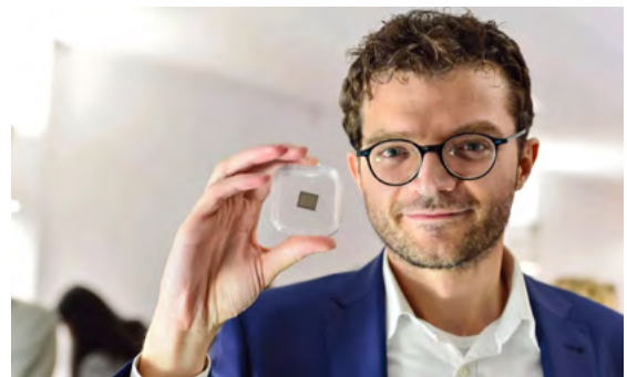
Hong Kong's dynamic innovation scene attracts French semiconductor company Prophesee setting up regional headquarters