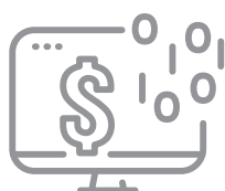
Financial Services and FinTech 金融服務及金融科技