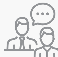
Business and Professional Services 商業及專業服務