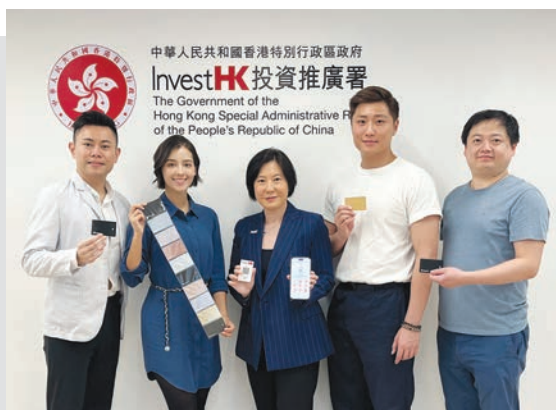
Tech startup WHOSiFY establishes its headquarters in Hong Kong to accelerate its operations. 科技初創公司WHOSiFY在香港設立總部，藉此加快其業務發展。