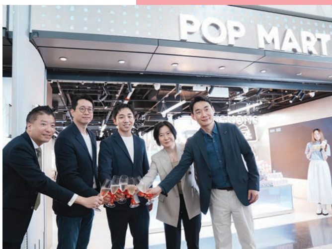
Pop Mart leverages Hong Kong's dynamic retail landscape to accelerate its global expansion. Pop Mart利用香港充滿活力的零售環境加速全球擴張。