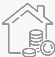
Family Office 家族辦公室