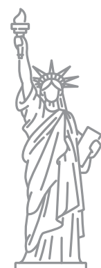
United States 美國