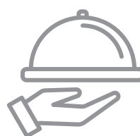
Tourism and Hospitality 旅遊及款待