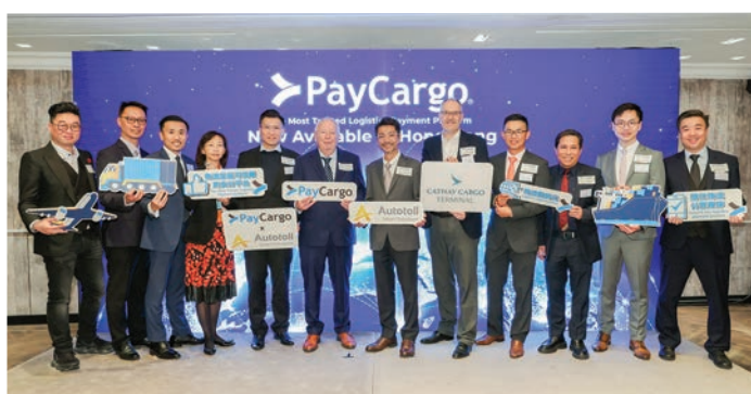
PayCargo opens its first regional office in Hong Kong as part of its overseas expansion plan in Asia. PayCargo在香港開設首個地區辦事處，藉香港拓展亞洲業務。