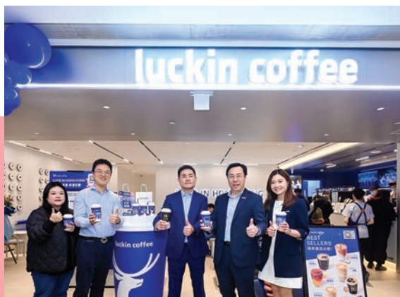
Mainland coffee chain Luckin Coffee opens five stores in Hong Kong, showing confidence in local market. 內地咖啡連鎖店瑞幸咖啡在香港同日開設五間分店，對香港市場前景充滿信心。