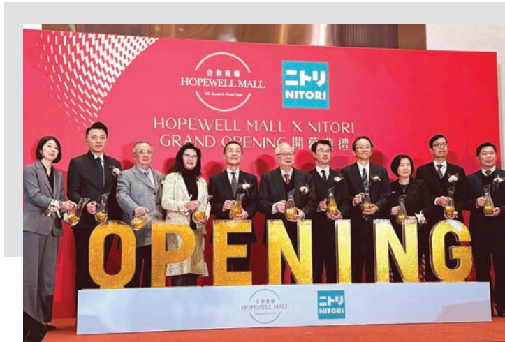
Japanese home-furnishing chain Nitori opens Hong Kong's largest flagship store. 日本家品連鎖店Nitori開設香港最大旗艦店。