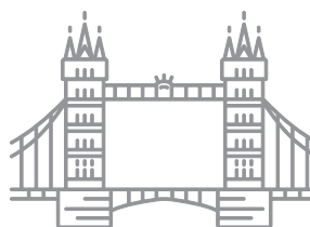
United Kingdom 英國