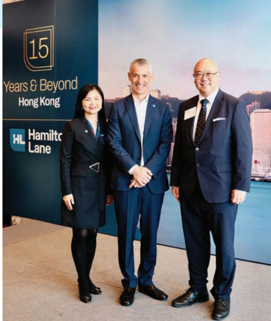
Hamilton Lane establishes first Hong Kong Limited Partnership Fund as part of expansion plan. 漢領資本在香港成立首個有限合夥基金及擴展香港業務。